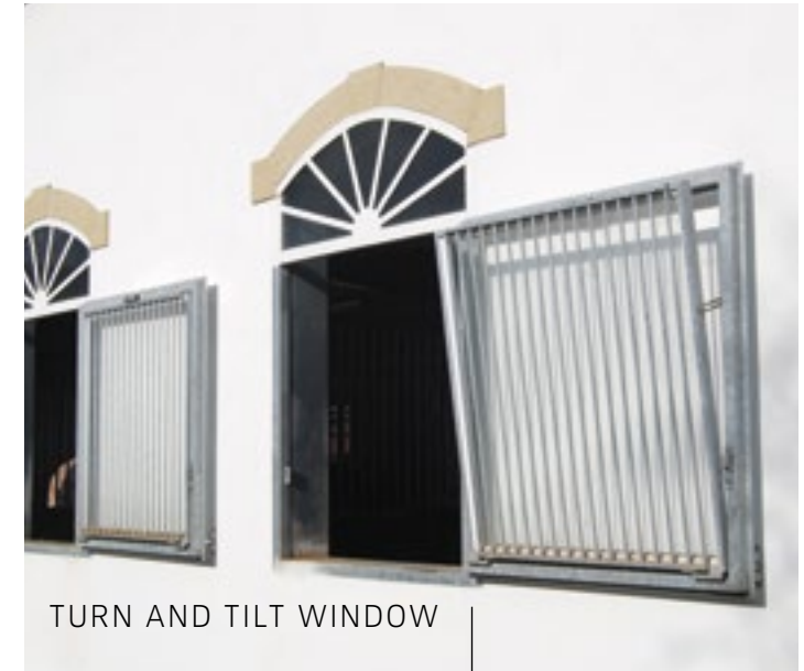
TURN AND TILT WINDOW

A tilt wing integrated into a turn window offers sufficient supply of fresh air also during the winter month.